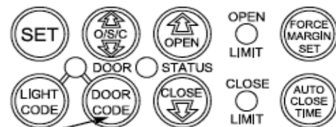
GDO-2 & GDO-4 Garage Door Opener Control Panel