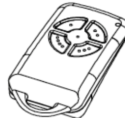
PTX-4 SecuraCode® Keyring Transmitter