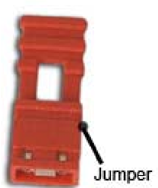
Receiver Card and the included jumper